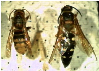
European hornet vs Cicada-Killer Wasp

What do they look like? Eastern Cicada-Killers have a rusty red head and thorax, amber-colored wings, and a black- and yellow-striped abdomen. Females are usually larger than males; Cicada-Killers range in size from 1 ¼ inches to 2 inches. Cicada-Killers are most commonly confused with European hornets. European hornets are yellowish-orange colored insects almost an inch long, build large paper nests, are attracted to lights, and tend to occur in natural areas.