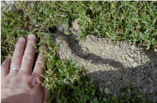
The burrow of a cicada killer.

Cicada-Killer Wasps are generally considered beneficial insects. These wasps take advantage of the conditions in your landscape and their habitat preference leads us to the most promising ways to reduce their abundance in a particular yard.